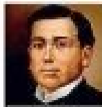
General Ignacio Zaragoza

The victory at the Battle of Puebla became a symbol of Mexican resilience and unity in the face of adversity. It inspired a sense of national pride and solidarity among the Mexican people, galvanizing their determination to defend their homeland against Foreign aggression. Cinco de Mayo emerged as a celebration of Mexican identity and the spirit of resistance against colonialism and oppression.